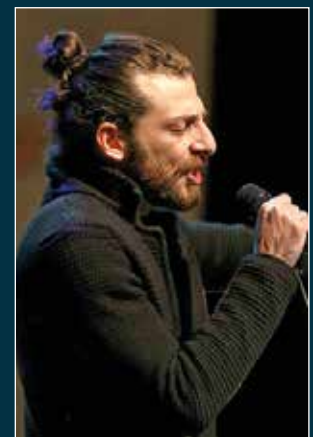
WADEE © DUNIA SOPIH