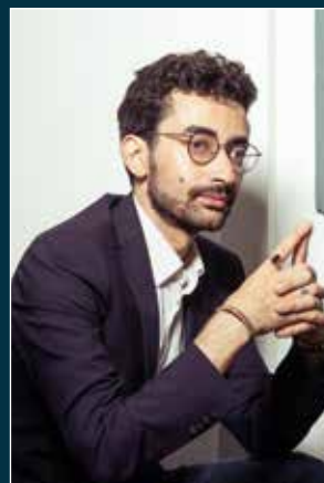
Omar YOUSSEF SOULEIMANE